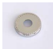
CK2 ROPE DESIGN