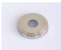
CK4 STEP DESIGN