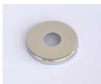
CK1 PLAIN DESIGN