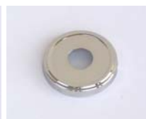
CK5 BAND DESIGN